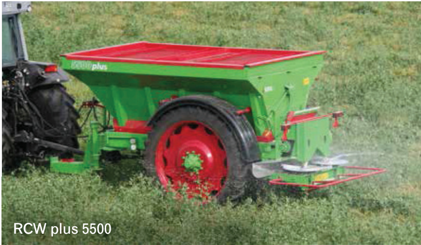
RCW plus 5500

lime and fertilizer distributors, attached, to fertilize plants in row cultivation